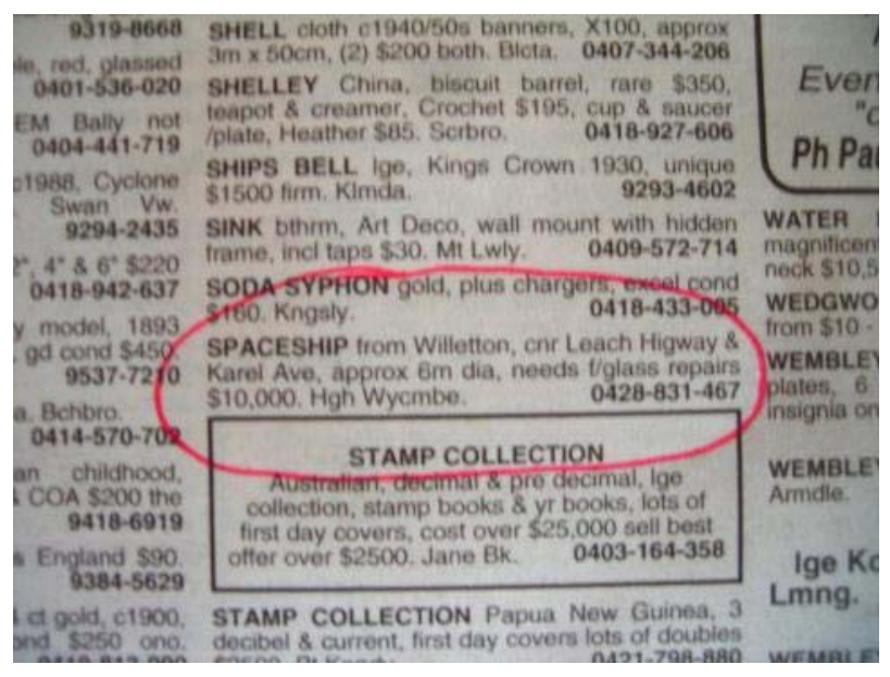
April 12, 2010 at 10:44pm